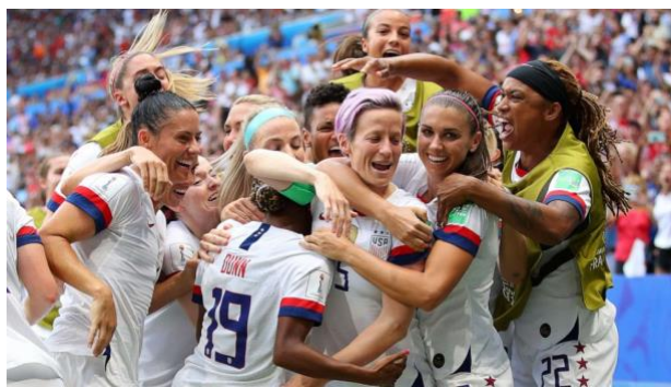
The U.S. Women's soccer team recently sued the U.S. Soccer league for discriminatory practices.