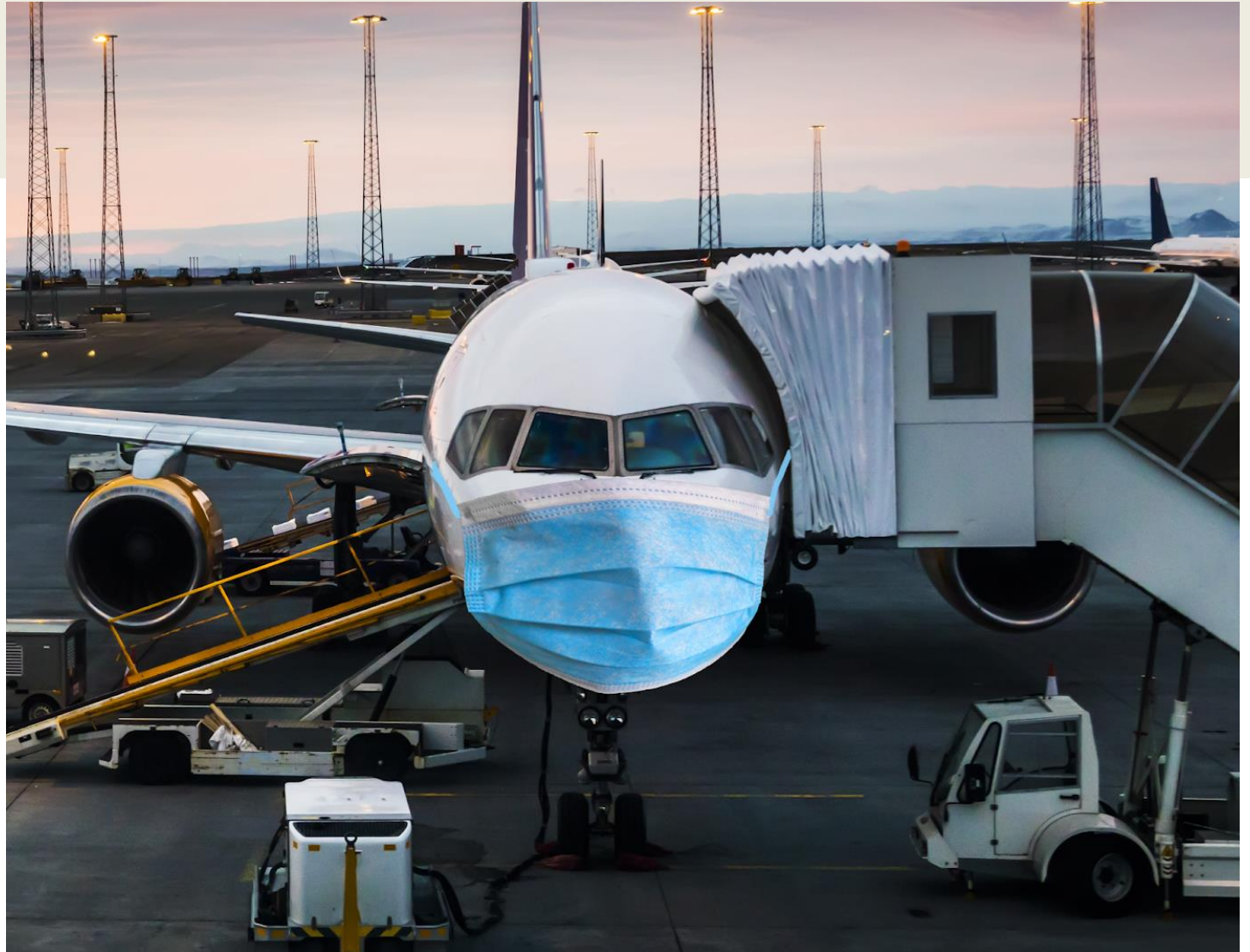
Airlines have been working tirelessly to ensure the safety of its passengers including making them wear masks and pumping in clean air into the cabin.

There used to be a time when the Left and the Right worked together, and that may seem crazy now because they don't really get