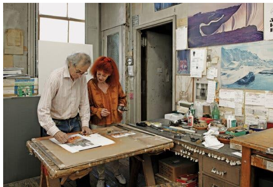
Christo and his wife Jean Claude at their New York City studio.