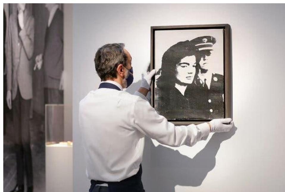
The 1964 Warhol photo “Jackie” was auctioned off for $1.1 million at the auction.