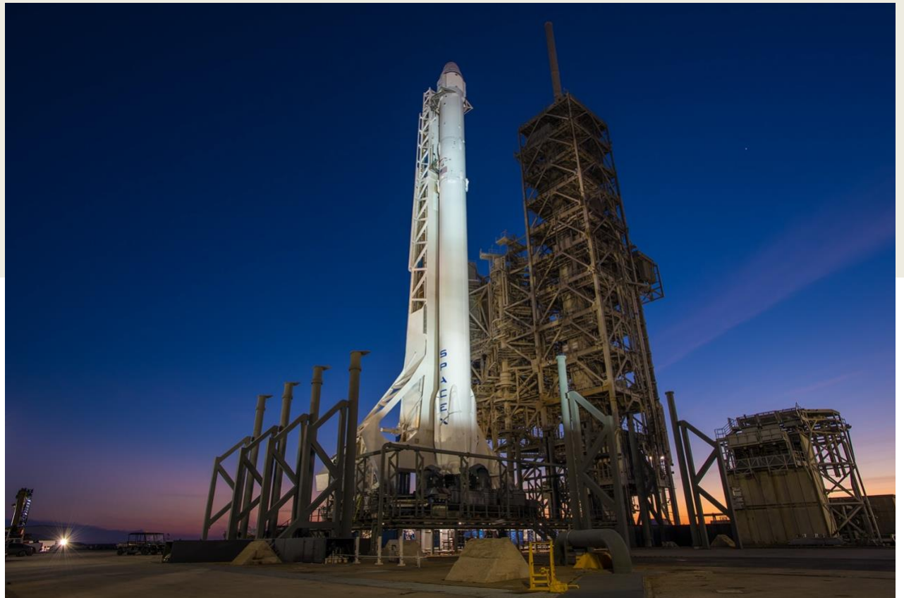
SpaceX's Falcon 9 rocket sits ready at Launch Complex 39A at NASA's Kennedy Space Center with a Dragon Space Capsule attached to its top.