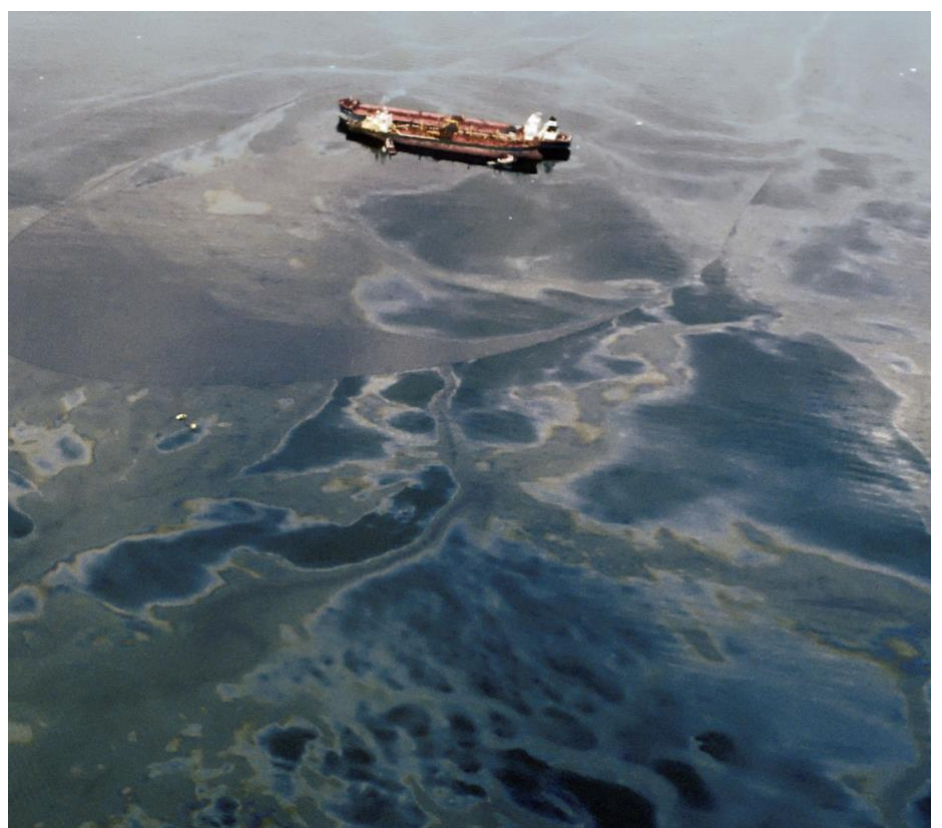
The Exxon Valdez Oil Spill polluted 6.5 million miles of ocean and the coastline of Alaska.