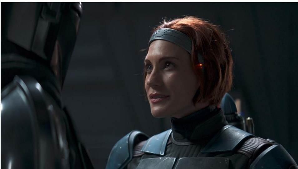
The show has returned fan favorite characters like Bo Katan who first appeared in the animated show, The Clone Wars .