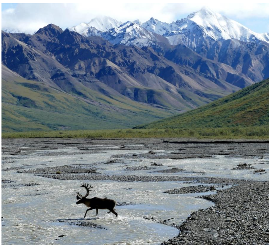
The Arctic National Wildlife Refuge is home to many animals like the moose pictured above.

I do not think that Exxon meant to spill all of the oil into the ANWR region. When I first read about the spill, I wondered what the ocean looked like but you can see hundreds of the destruction.