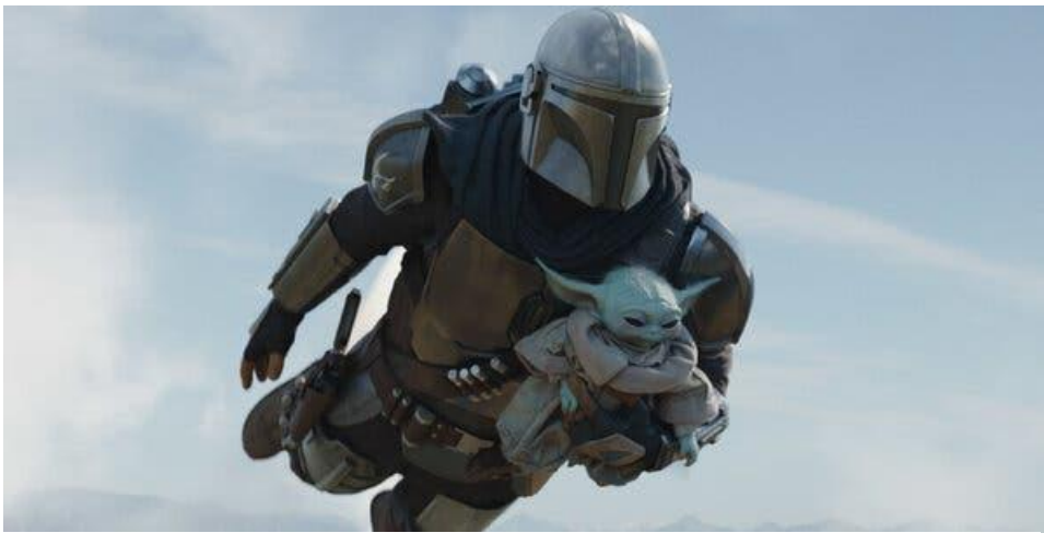
The stars of Disney+'s The Mandalorian , Din Djarin and Grogu, have rocketed the show to rave reviews.

our doubts about the last election. And I actually hear some people say ‘just don't vote,’ but my fellow Americans, if you don’t vote, they win.” said Pence at Trump's last rally in Valdosta, Georgia, on December 5th. Pence tried to stir up support for the race. Trump raised a similar message at the same rally stating, “Friends of mine say, 'Let’s not vote. We are not going to vote because we are angry about the presidential election. But if you do that, the radical left wins.’”