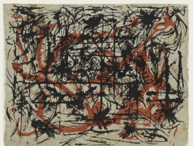
Untitled by Jackson Pollock is one of the pieces on display in the “Degree Zero: Drawing at Midcentury” exhibition.

There is artwork by Louise Bourgeois, Yayoi Kusama, Henri Matisse, Jackson Pollock, and Alfredo Volpi just to name a few. I looked at a few pictures of the art from the “Degree Zero” exhibition. All of it seems very abstract. The show reveals how the artists used drawing to start from scratch after the war. “Degree Zero: Drawing at Midcentury” allows you to notice connections between very different artists of the same time period.