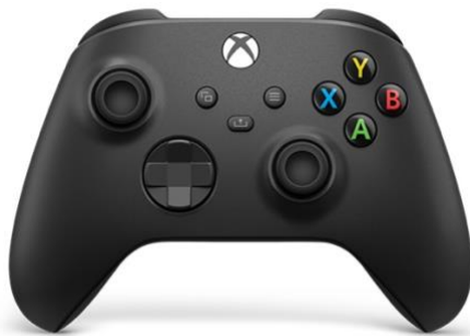
Video game controllers like the Xbox One controller, pictured above, have haptic feedback technology embedded in them to provide physical sensations while gaming.

The use of haptics is not to make games more real but to improve the experience of the person using the device. The sense of touch has an emotional impact and this is something technology companies know is true from research. When the sense of hearing or vision is busy or overloaded then the sense of touch remains another way to communicate. This truly will be the future of “immersive entertainment.”