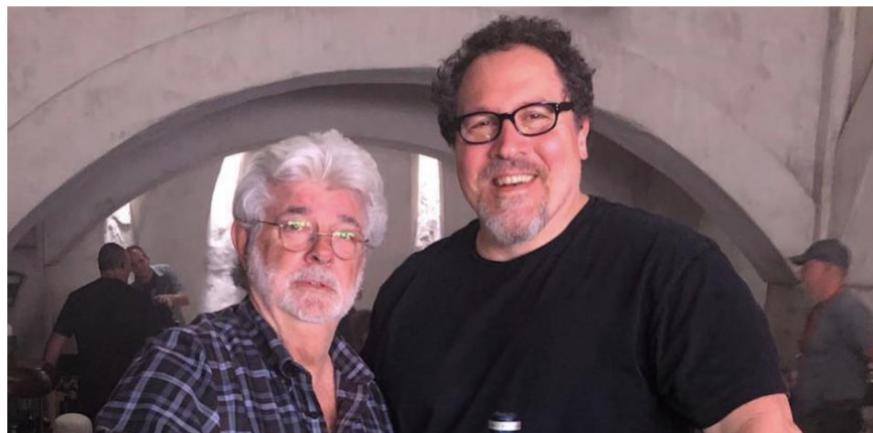
Star Wars creator, George Lucas (left), with The Mandalorian creator, Jon Favreau (right) on the set of The Mandalorian .