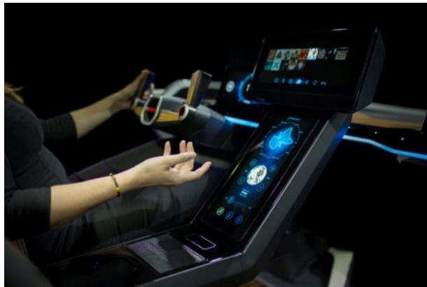
As touchscreens become more prevalent in automobiles, carmakers are beginning to invest more in haptic feedback technology.

This technology is used in a vest that can be worn by the person playing the video game. Its vibrations syncs with the actions in the game. For example, as you are playing a combat game and you take a hit or boxing game and get punched, you will feel very mild vibration feedback to the area where you got hit. The haptics will turn on in the precise location where your character received an impact in the game. It is done with various modalities like small levers to simulate touch, a laser to simulate soft touch, or a small motor to feel like a vibration. There are also companies working on contactless haptic technology that do not require the player to come in contact with any surface so that means no need to wear vests or use controllers. This works by using lasers or ultrasound to create tactile sensations in mid-air that players will feel on them at various locations.