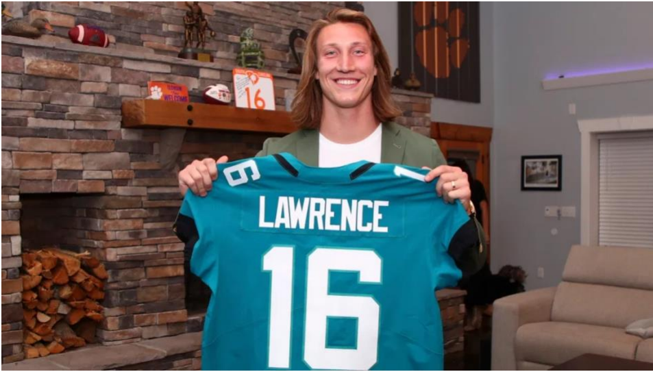
Clemson star quarterback, Trevor Lawrence, was the first overall pick in the 2021 NFL Draft. He was selected by the Jacksonville Jaguars.