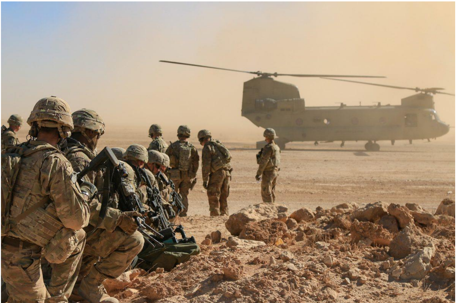
American soldiers in Afghanistan wait to board Boeing CH-47 Chinook to leave the still unstable country.

We as Americans fight for the sovereignty of other countries and to defend the motherland from potential threats like the terrorists of the Middle East.