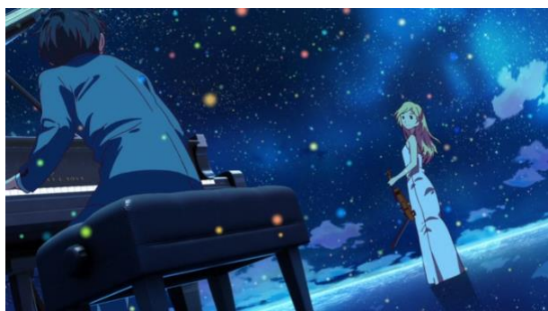
Images from the Netflix anime series, Your Lie in April .