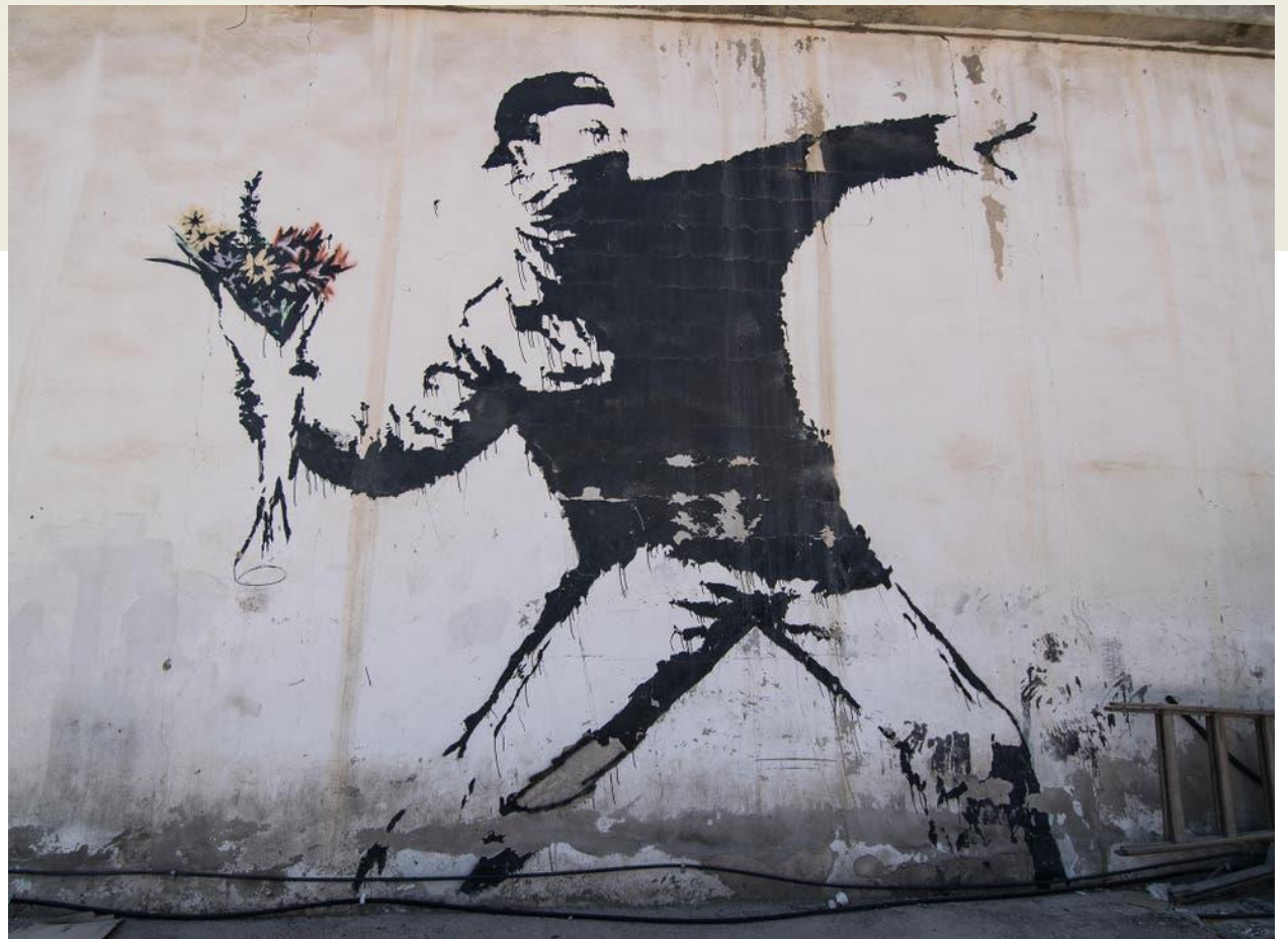
Artists like Banksy whose work pictured above is a perfect example of 21 st Century art trends.