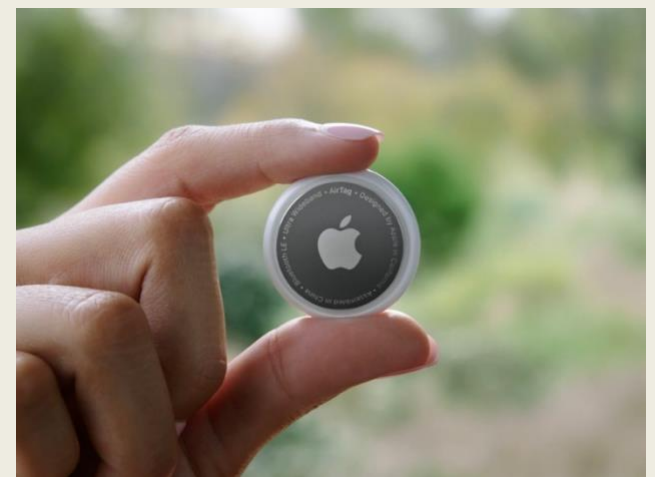
Apple released the Airtag on April 30, 2021. It costs $29 for a single Airtag, and $99 for a pack of four.

Although another competitor exists in the smart tracking called TILE, the Apple Airtag is better. TILE works similarly to the Airtag, but TILE is not quite as unique as the Airtag because it utilizes commonplace Bluetooth technology which is inferior to Apple's new Ultra-wideband technology. Personally, I think the price tag on the product makes it a steal.