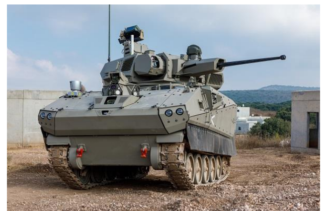
Elbit creates systems for weapons like this small semi-autonomous tank. Elbit sold this tank to the U.S. Army. It normally takes a crew of three or four to effectively operate this tank, but Elbit’s software allows a two man crew to command it.

Why does Australia really want to leave Elbit’s defense and military systems? Australia wants to leave because they feel like Elbit’s defense group has not done enough. They have not really helped Australia move forward like Australia thought they would with these new systems. Elbit’s systems have not helped Australia at all and Australia says that they are going too slow. “We need these gadgets now and they [Elbit] always say we will be as fast as we can. But they are not living up to the expectations at all.” said an Australian military commander.