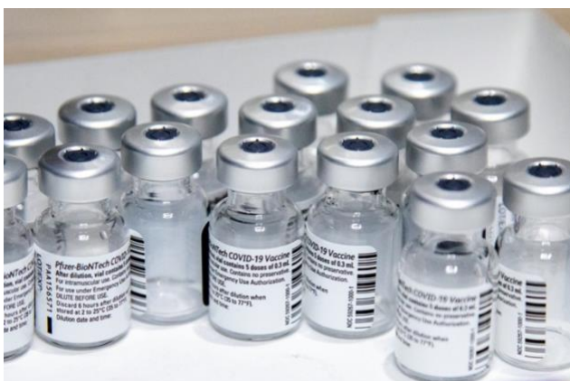
Canada will receive 76 million vaccine doses.

Canada and Pfizer have made a deal that Canada will get 76 million doses. Canada is not the only country Pfizer has made a deal with because they have also sent it to Mexico. More than 10 million vaccine doses have been shipped there. Brazil also made a deal with Pfizer and will get 100 million doses. Pfizer is using extra factory capacities to maximize their output, elucidated a source.