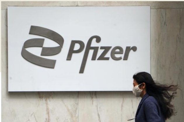
Covid vaccines will make up 20% of Pfizer's profits, its greatest source of revenue.