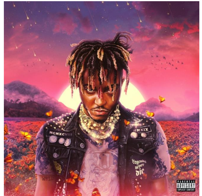
Above: The cover of Juice WRLD’s posthumous album, Legends Never Die that included the hits “Wishing Well,” “Come & Go” “Righteous,” and “Hate the Other Side.”