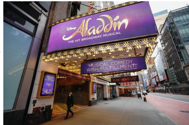
Productions like Disney’s Aladdin have been hurt by COVID-19 as the virus has forced theaters to shut down.