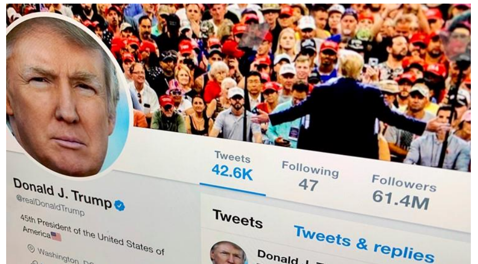
Twitter suspended Donald Trump's account citing Section 230.

I believe that both technology companies and private citizens that post content all should be held responsible and held accountable for providing and posting true and accurate facts.