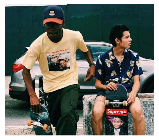
Supreme was originally intended for the skater demographic, pictured above, using a Supreme board and wearing Supreme clothes.