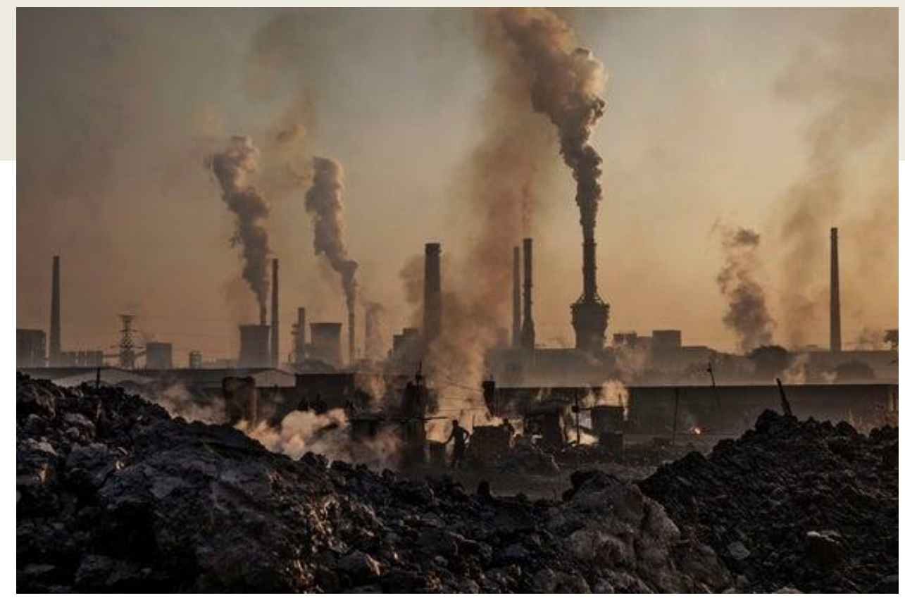
Human generated emissions like those created at coal powered power plants, pictured above, are causing the Earth's temperatures to rise.