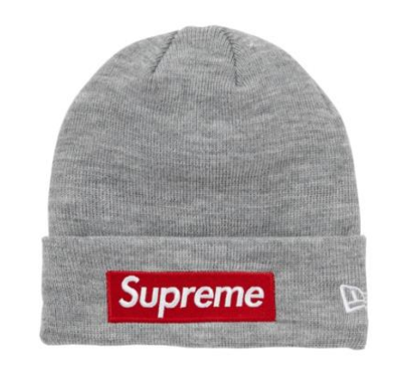
A Supreme beanie, like the one above, can cost $300 or more.

To me this is idiotic. I would never pay several hundred dollars just to wear a white shirt that only says Supreme. At least now, you, dear reader, know why people like it so much. However, I still think these shirts are not worth spending hundreds of dollars on.